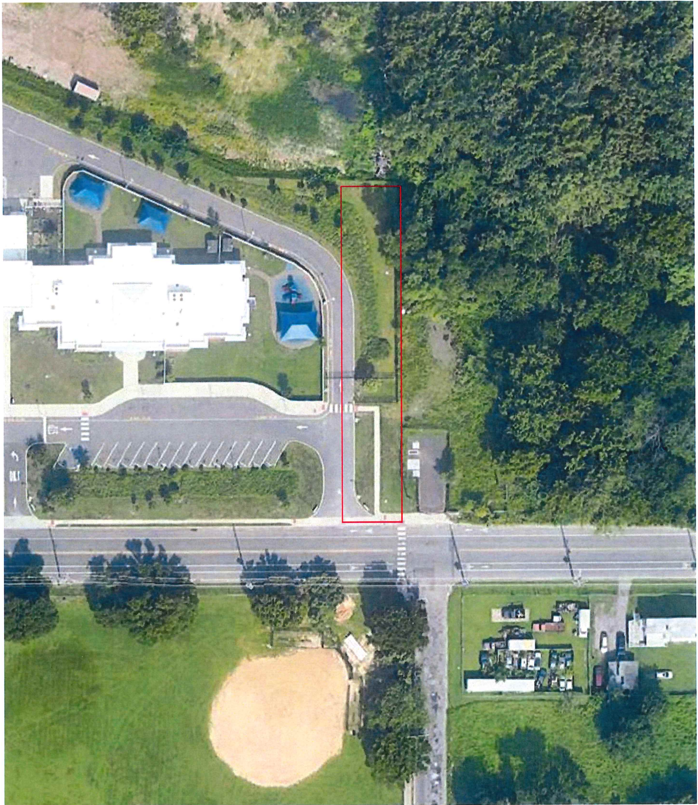
Exhibit A Aerial View of Site